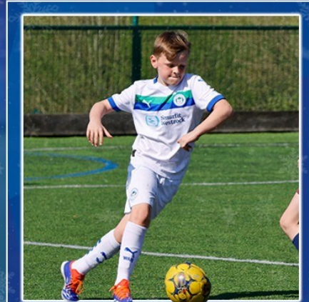
DEAN TRUST WIGAN

22ND DECEMBER- 23RD DECEMBER 9AM - 3:30PM