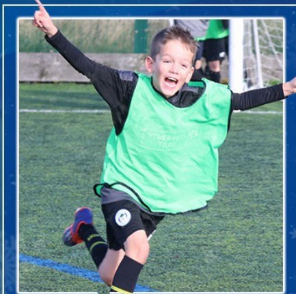
ASHTON LEISURE CENTRE