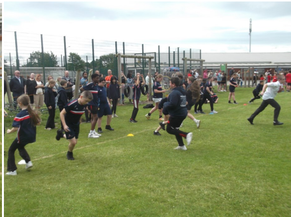
6F enjoying their final Westfield Sports Day